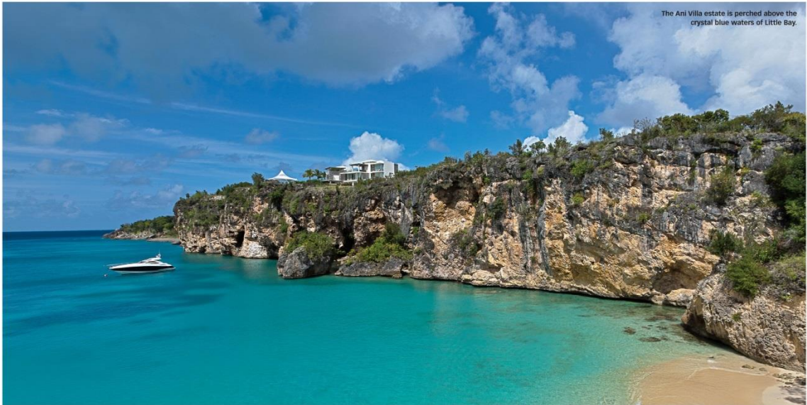
The Ani Villa estate is perched above the crystal blue waters of Little Bay.